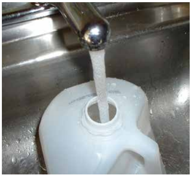
Ordinary tap water can be used for the engine coolant mixture, if it's not hard. But why risk it when there's a very cheap alternative?

point than most contaminants (including minerals), they are left behind when the water turns into steam. The resulting water is, therefore, very pure. In addition, some water is double- or triple-distilled.