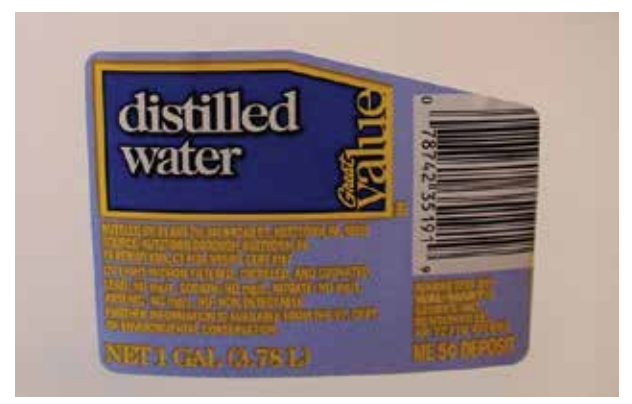
To us, the obvious choice is distilled water. It's cheap and ubiquitous.

So, unless you know your tap water is extremely hard then it is probably all right to use. Better yet, play it safe and buy distilled water in bulk and have it on hand. Using that and Genuine Mercedes-Benz antifreeze you can rest assured you are putting the best product you can in your customer's cars.