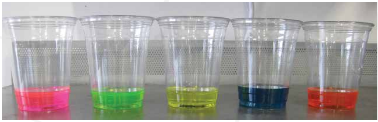
Don't be fooled by all the different colors. Specification and ingredients are the key!