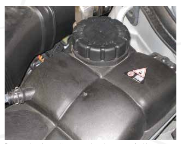
For many decades, cooling systems have been pressurized by the use of a cap that determines the psi at which it vents.

Oxidation and corrosion occur inside the cooling system. Corrosion occurs when oxygen and dissolved minerals or salts in the coolant react with metal surfaces. It can also be the result of electrolysis, an electro-chemical reaction between dissimilar metals (such as aluminum and cast iron), or from stray electrical currents that pass though