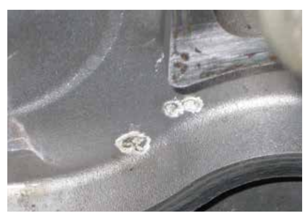
This is an example of corrosive action causing pitting in an aluminum housing.

The term "engine coolant" is widely used in the automotive industry, which covers its primary function of convective heat transfer, but doesn't hint at lowering the freezing point. When used in an automotive context, corrosion inhibitors are added to help protect vehicles' radiators,