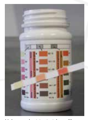
Using coolant test strips will tell you the condition of the antifreeze/water mixture.

which you place a drop of coolant, then look through to determine the refractive index of the mixture. The simplest thing, which is quite accurate, is the quick and easy test strip. Simply dip the strip, compare the results with the color chart on the bottle, and you'll have a test result showing you freeze point, and nitrite and PH levels. You can also staple it to the repair order to show the customer.