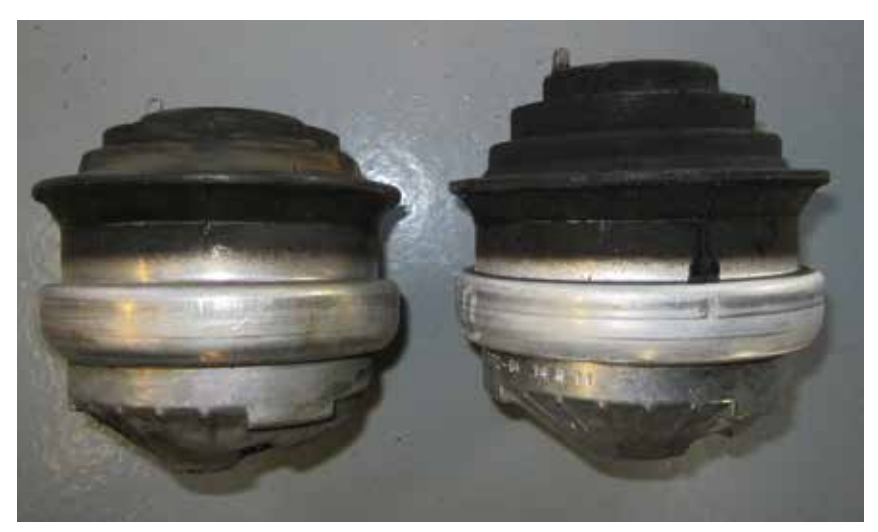
The worn and broken engine mount on the left was causing drive train vibration at all speeds. Notice the height difference to the new one on the right. Installing new mounts restored the vehicle's driveline angles back to normal.

Virtually anything that moves in a vehicle can produce an unwanted vibration. The upside to this is that most problems can be broken into two groups: stationary vehicle vibration and moving vehicle vibration. The downside is that there is no magic way to easily diagnose either type. Like most problems that are brought into the shop, asking the right questions may possibly narrow the complaint down more quickly. These questions may include, but are not limited to: