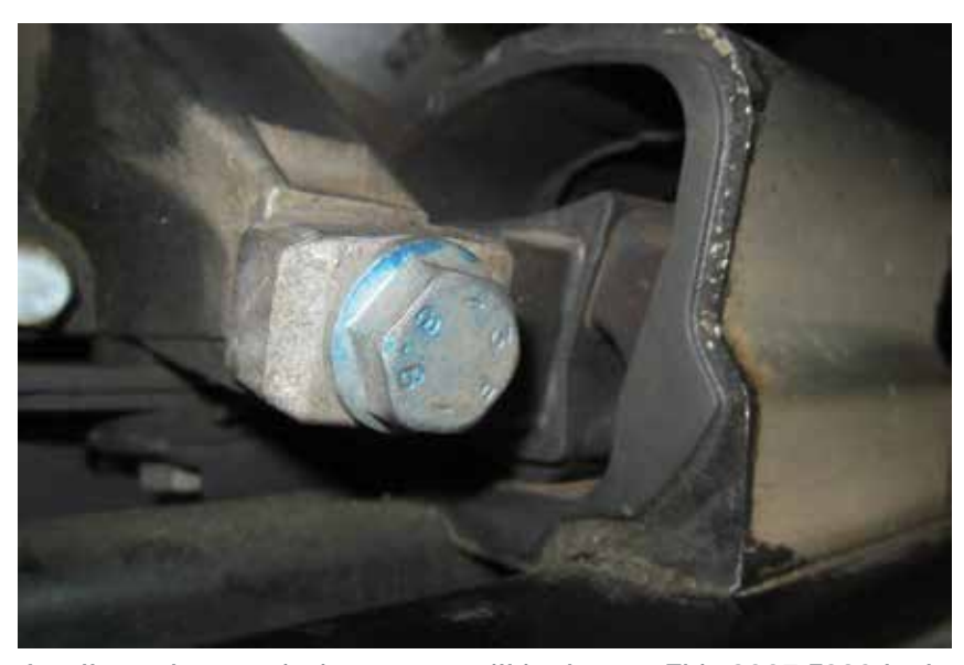
A collapsed transmission mount still in the car. This 2007 E320 had driveline vibration above 40 mph.