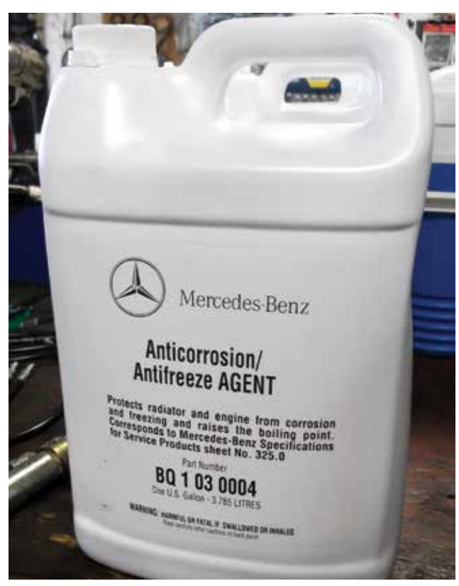
With today's strict guidelines for antifreeze, is there ever a reason to use anything but the exact O.E. formula?

prices are competitive. It's often found that certain parts, fuel filters for instance, are more expensive from aftermarket suppliers. And there's never an issue with quality, fit, or warranty protection when you go genuine.