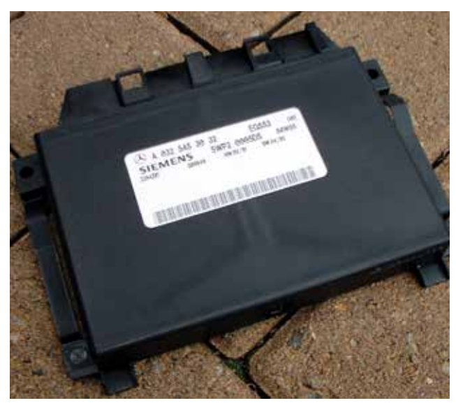
The cost of replacement engine management computers (PCMs for Powertrain Control Modules, to use SAE's standardized terminology) is another thing on which Mercedes-Benz has instituted money-saving programs.

Air filters are tested for 2,000 miles over the same route. The tests have proved that the use