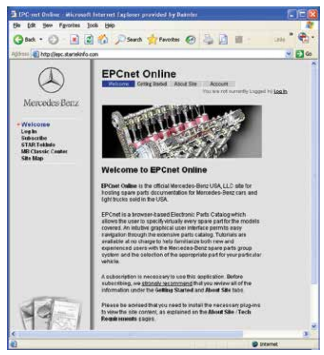
The EPC (Electronic Parts Catalog) is sophisticated and comprehensive. You'll always get the right part the first time. It's free, too. Just visit http://epc.startekinfo.com.