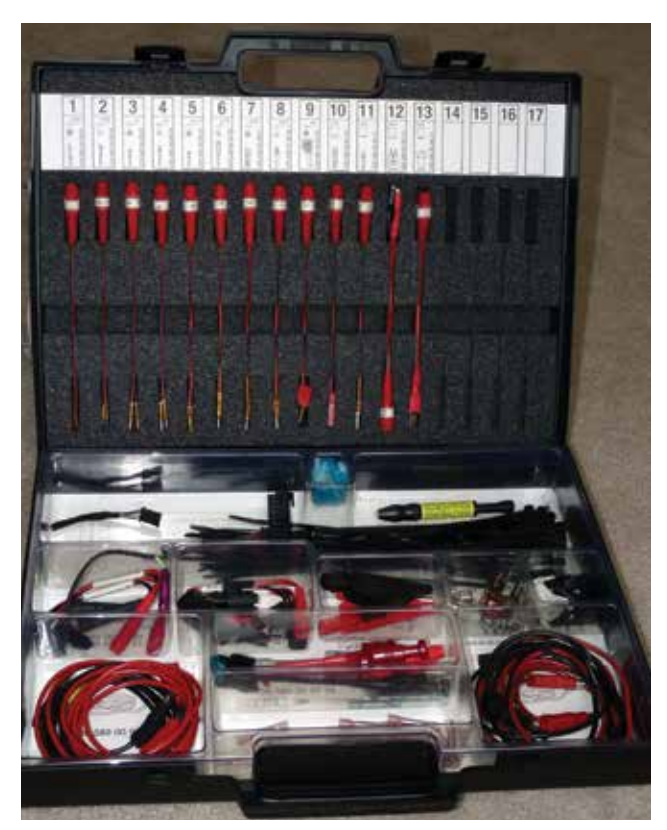
It's not only parts, but also tools and equipment. Where else can you get something like this comprehensive electrical connection kit but from your local Mercedes-Benz dealer?

We'll conclude with a statement from another Mercedes-Benz expert: "Say you have a customer who's spent lots of money to buy a nice E-Class. Using non-genuine parts would be like replacing a link in a chain with a paper clip. It impacts the entire performance level of the car." |