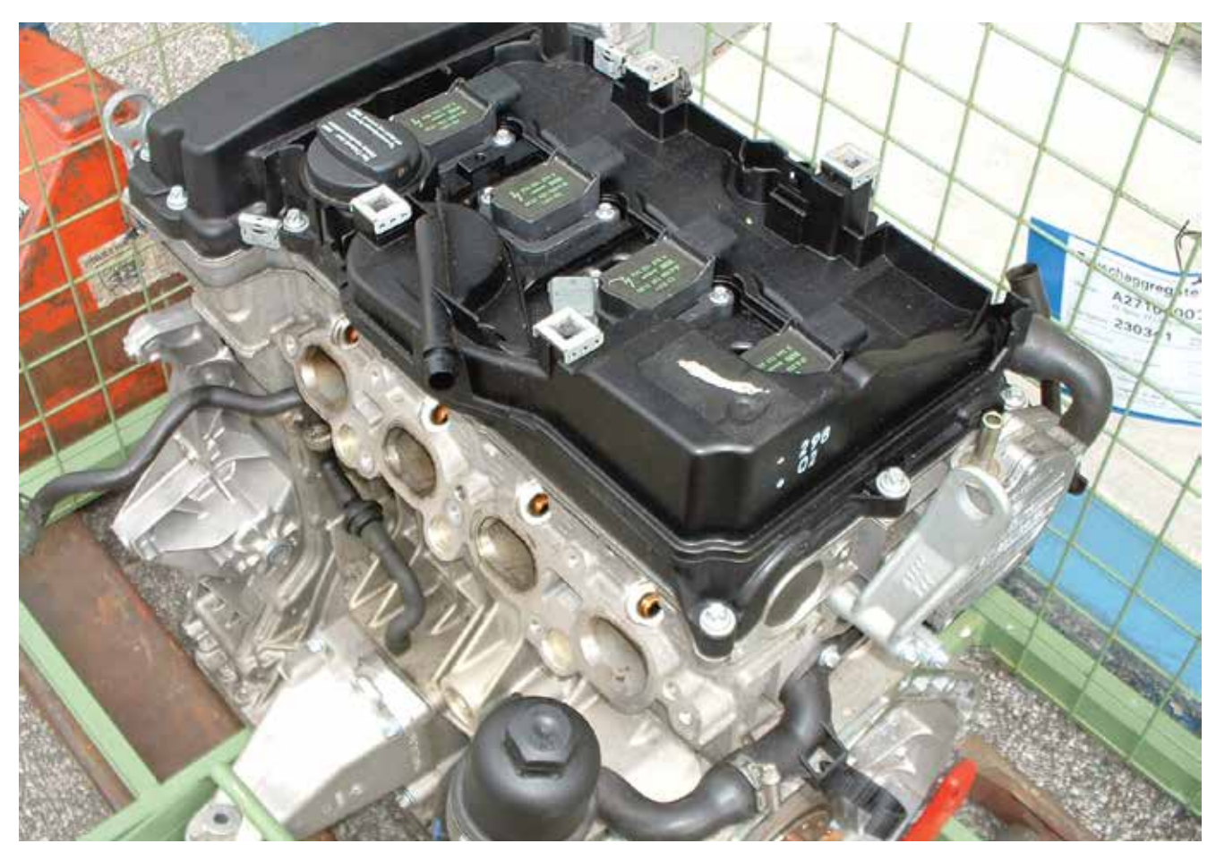
. . or this remanufactured engine have the industry's strictest quality control, and carry unequalled warranties. They're also often the subject of aggressive price-cutting programs.

color when replacement is needed, which amounts to a great sales tool. Installation is far easier and faster, too, without all the confusion of the various attachment parts of aftermarket versions. If you look at it over the course of a year, this can add up to hundreds of dollars worth of labor.