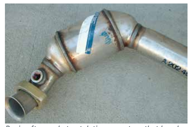
Basic aftermarket catalytic converters that barely meet EPA guidelines are notorious for having short lives. This genuine replacement unit will last as long as the original.