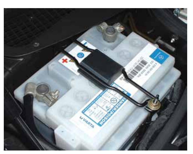
Genuine Mercedes-Benz replacement batteries are made by the best European manufacturers.

That's not the kind of high-handed pricing policy Mercedes-Benz follows. The company does a yearly evaluation to make sure its